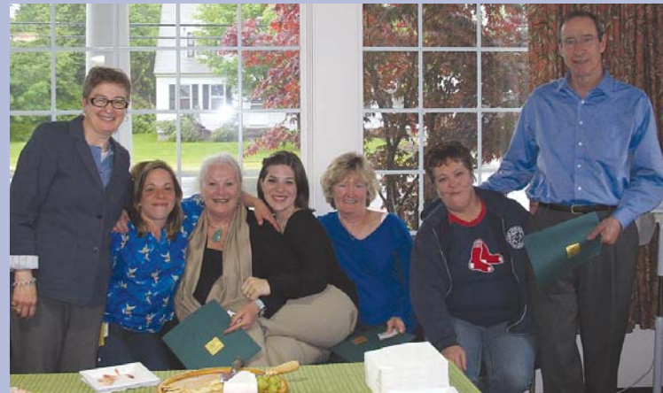
Newly trained Hospice Volunteers gather at a special reception in June in their honor!