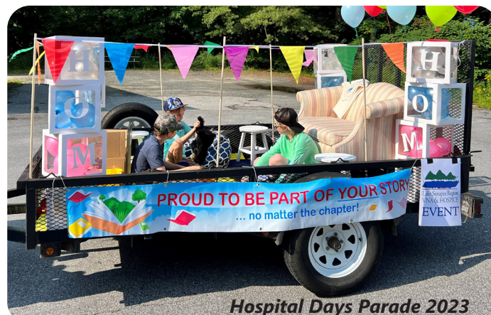
Hospital Days Parade 2023