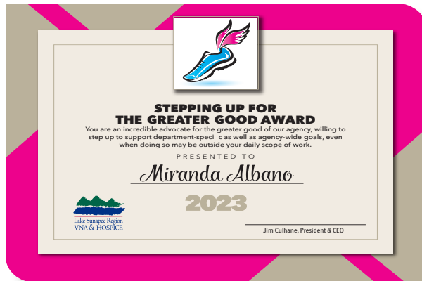
Stepping Up For The Greater Good Award Miranda Albano, PTA, COTA/L