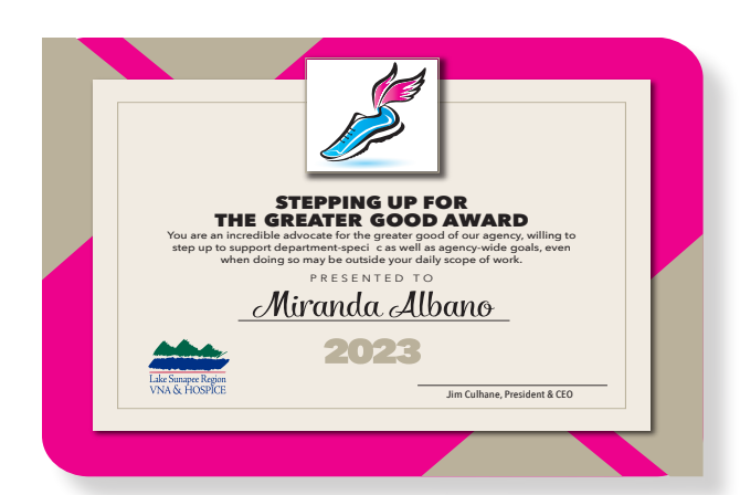
Stepping Up For The Greater Good Award Miranda Albano, PTA, COTA/L